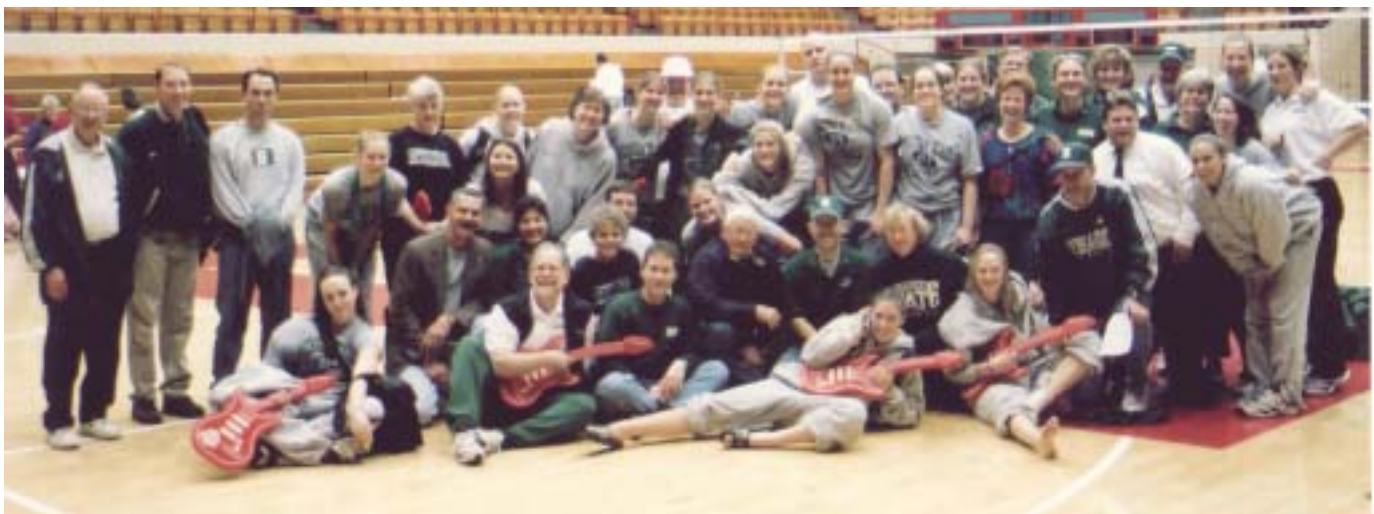
The Spartan volleyball rock band, with their souvenir red foam guitars, pose with SideOut Club members in Columbus.